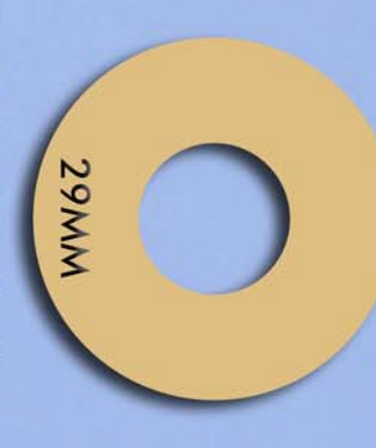
FOR 2.6" MMC KITS